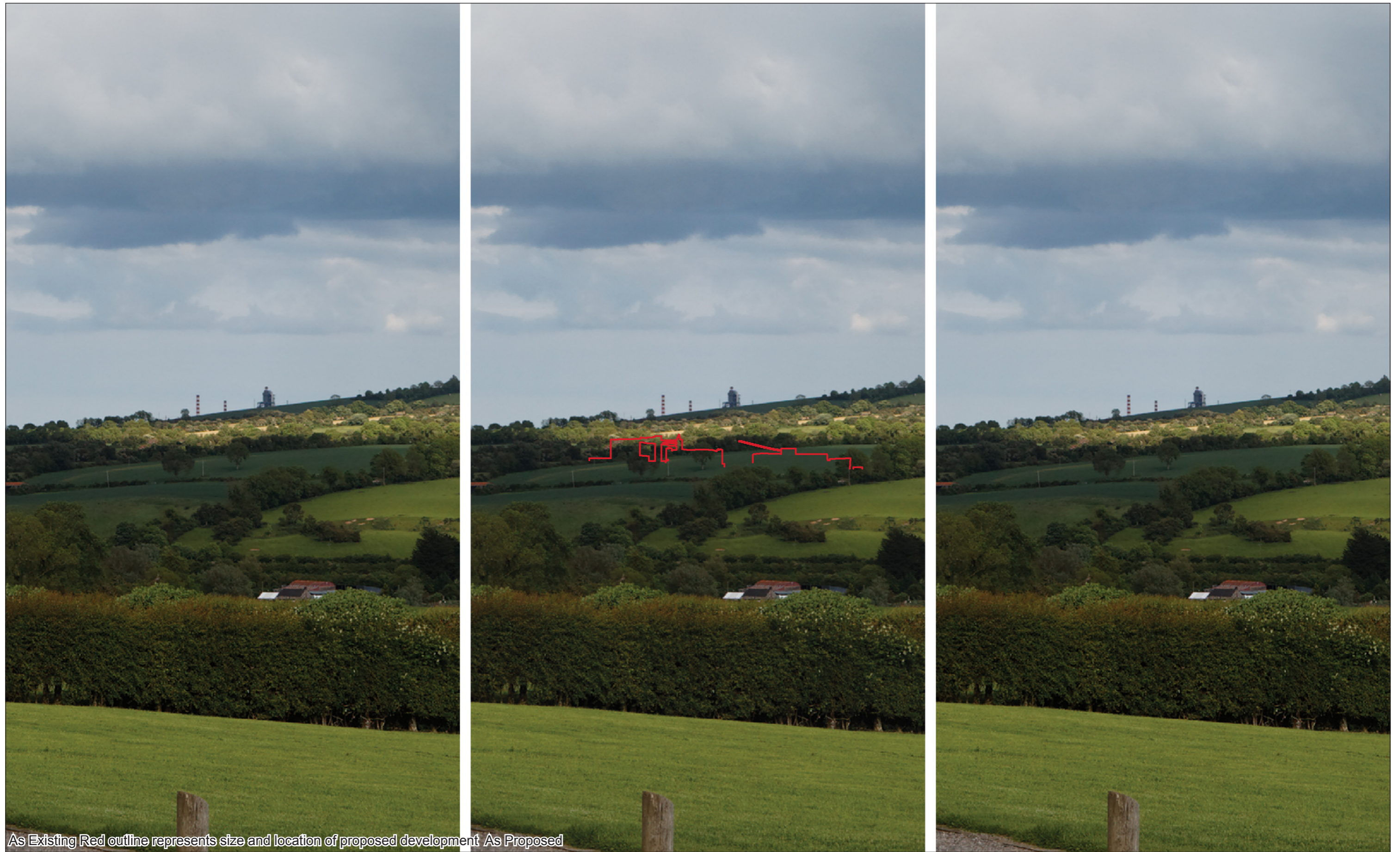
As Existing Red outline represents size and location of proposed development As Proposed